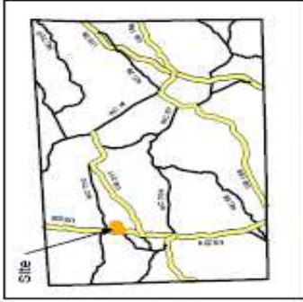
Vicinity Map - Rockingham County